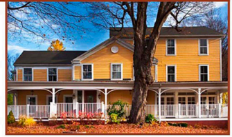
Photo size is 1" height x 1.65" width (Must be interior (full or partial) or exterior of business)

cucinawoodstock.com • Located in an iconic, restored yellow farmhouse in historic Woodstock. The contemporary Italian menu centers around local, seasonal ingredients, created by Chef Gianni Scappin and his culinary team. Dine on our covered, heated porch, by fireside dining in the winter and at our contemporary bar. Takeout, catering and off premise events. Open 7 days.