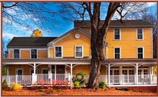
Photo size is 1” height x 1.65” width (Must be interior (full or partial) or exterior of business)

109 Mill Hill Rd, Woodstock, 845-679-9800 cucinawoodstock.com • Located in an iconic, restored yellow farmhouse in historic Woodstock. The contemporary Italian menu centers around local, seasonal ingredients, created by Chef Gianni Scappin and his culinary team. Dine on our covered, heated porch, by fireside dining in the winter and at our contemporary bar. Takeout, catering and off premise events. Open 7 days.